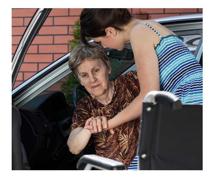
Seniors : While seniors overall are <u>staying in the labor</u> <u>force longer</u>, only 9% of Mississippi seniors with disabilities were in the labor force in 2019, compared to 23% of seniors without disabilities.

Rates of labor force participation also varied by type of disability in Mississippi. In 2019, approximately half (51%) of people (age 18-64) who were deaf or had a hearing disability, and 48% of people who were blind or had a vision disability were working or looking for work. But people with other types of disabilities were more likely to be out of the labor force -74% of people with a cognitive disability, 77% of people with an ambulatory disability, 84% of people with disabilities that affect a person's ability to live independently, and 85% of people with disabilities that make self-care difficult.